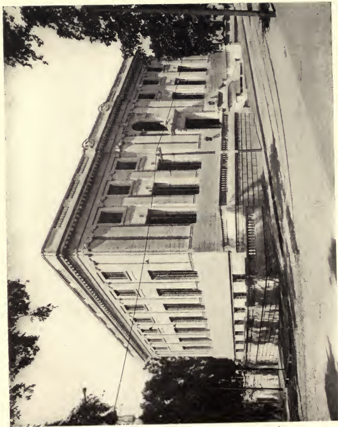
JOHN HAY MEMORIAL LIBRARY